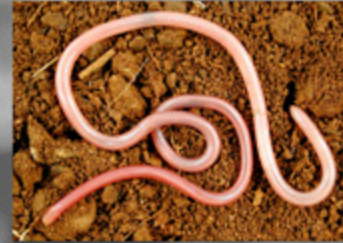
Ramphotyphlops nema Northern Blind Snake