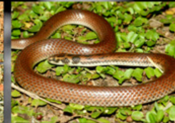
Suta punctata Little Spotted Snake