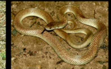
Pseudechis sp. Pygmy King Brown Snake