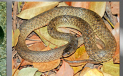
Tropidonophis mairii Keelback