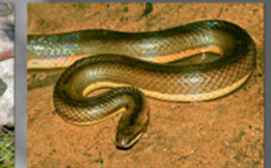
Enhydryis polylepis Macleay's Water Snake