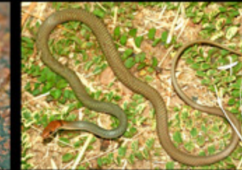
Demansia olivacea Olive Whipsnake