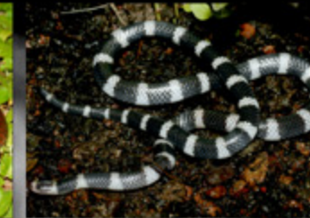
Vermicella intermedia Northern Bandy Bandy