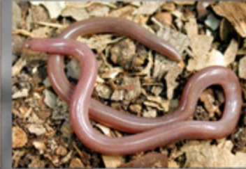
Ramphotyphlops diversus Diverse Blind Snake