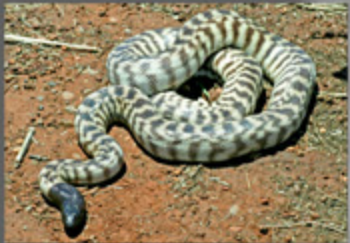
Aspidites melanocephalus Black-headed Python