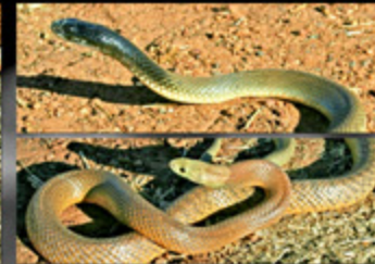
Pseudonaja nuchalis Western Brown Snake