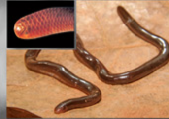
Ramphotyphlops braminus Flowerpot Snake