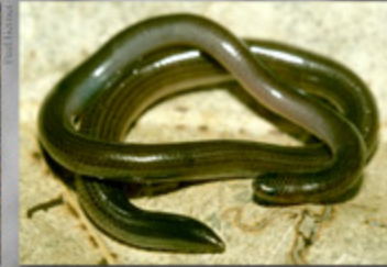
Ramphotyphlops tovelli Darwin Blind Snake