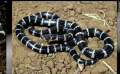
Vermicella multifasciata Narrow-banded Bandy Bandy