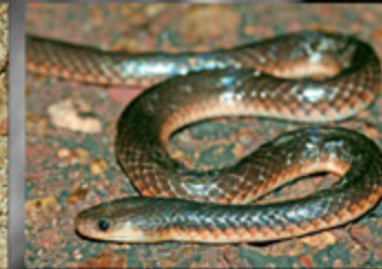
Cryptophis pallidiceps Northern Small-eyed Snake