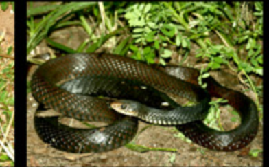
Demansia papuensis Greater Black Whipsnake