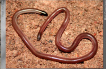
Ramphotyphlops guentherii Guenther's Blind Snake