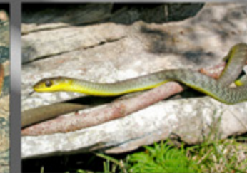
Dendrelaphis punctulatus Golden Tree Snake