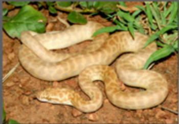
Antaresia childreni Children's Python