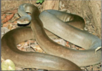
Liasis olivaceus Olive Python