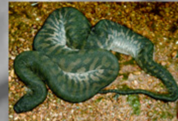
Achrochordus arafurae Arafura File Snake