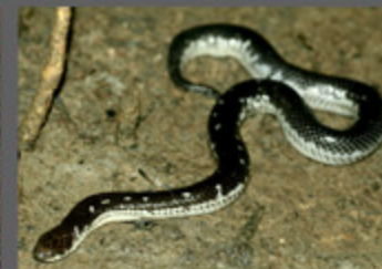
Fordonia leucobalia White-bellied Mangrove Snake