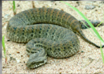
Acanthophis praelongus Northern Death Adder