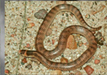
Brachyuropsis roperi Northern Shovel-nosed Snake