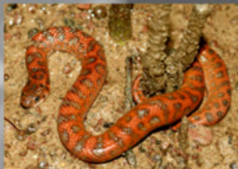
Fordonia leucobalia White-bellied Mangrove Snake