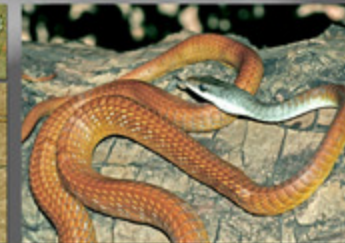
Dendrelaphis punctulatus Golden Tree Snake