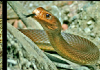
Oxyuranus scutellatus Coastal Taipan