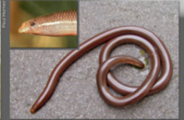
Ramphotyphlops unguirostris Claw-snouted Blind Snake

Darwin and surrounds, a place rich in biodiversity in the Top End of the Northern Territory, boasts over 40 species of snakes. While most of the species depicted are widespread, some are only found in the outermost regions. Many snakes exhibit colour variations among species as well as among individuals within a single species, making identification difficult.