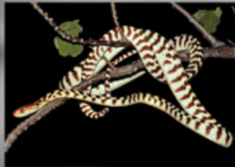
Boiga irregularis Brown Tree Snake