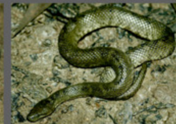
Myron richardsonii Richardson's Mangrove Snake