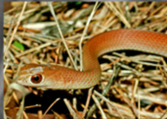
Demansia vestigiata Lesser Black Whipsnake