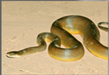
Liasis fuscus Water Python