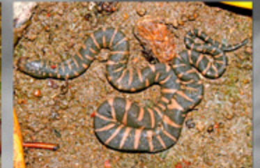
Achrochordus granulatus Little File Snake