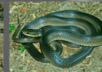
Stegonotus cucullatus Slatey-grey Snake