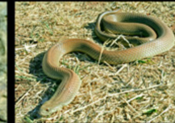
Pseudechis australis King Brown Snake