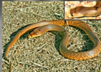
Pseudonaja nuchalis Western Brown Snake