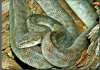
Antaresia childreni Children's Python