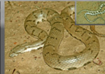
Cerberus australis Australian Bockadam