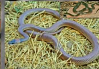
Furina ornata Moon Snake